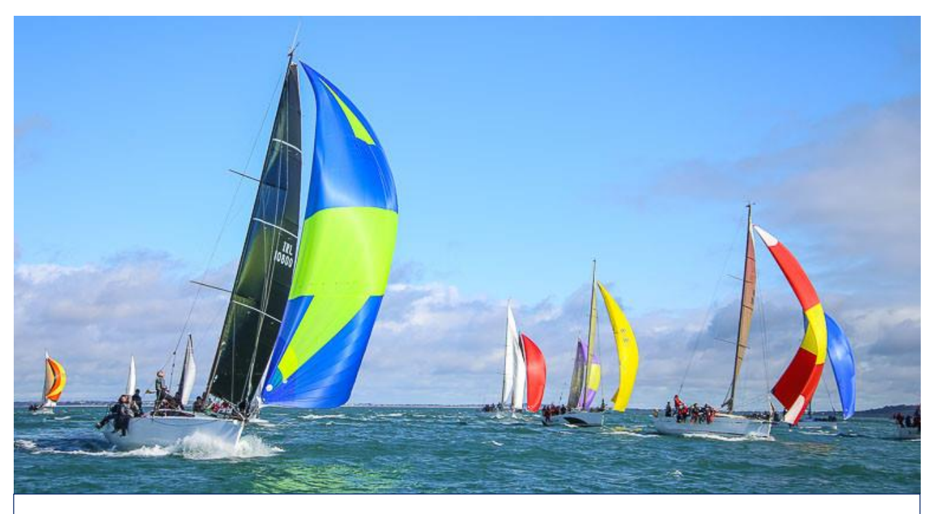
ISORA is Affiliated to Irish Sailing, RYA and RYA Cymru Wales

When a Rule is modified in the SSIs, it takes precedence over the Rule in this Notice of Race and General Sailing Instructions.